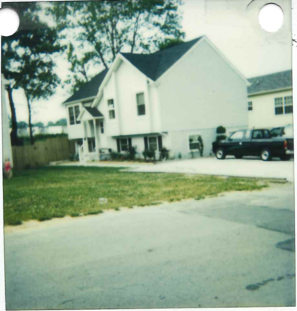
3925 - No front door! Glenhurst 50' Lot