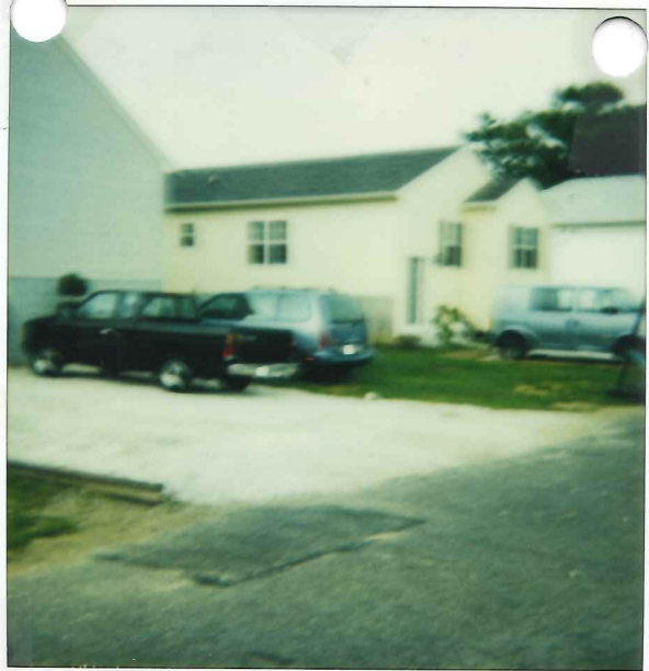
3923 Glenhurst 50' Lot