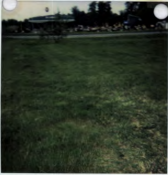
3905 my Ground