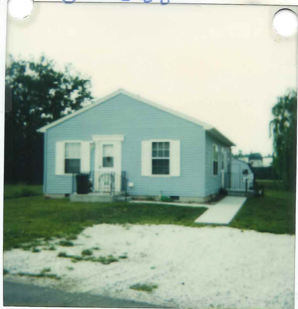
3929 Glenhurst 2 yrs old