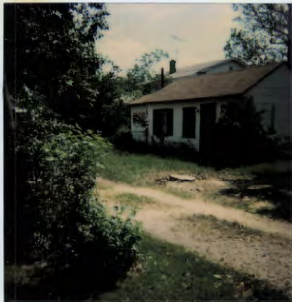
Left Side From Road