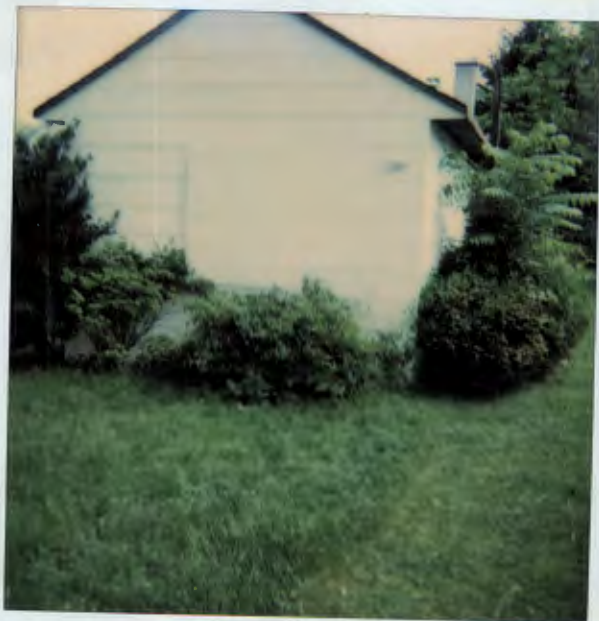
Right Side of Road Front River