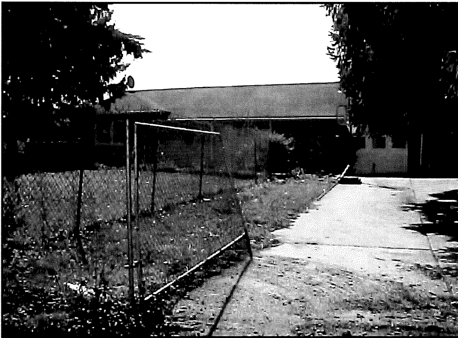
FRONT VIEW OF SUBJECT PROPERTY