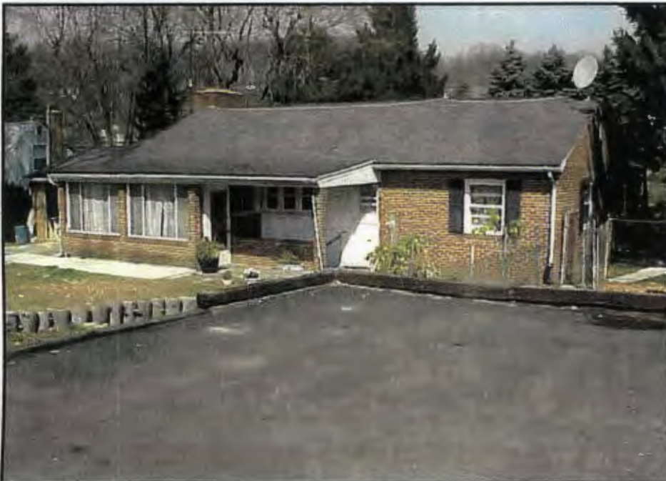
REAR VIEW OF SUBJECT PROPERTY