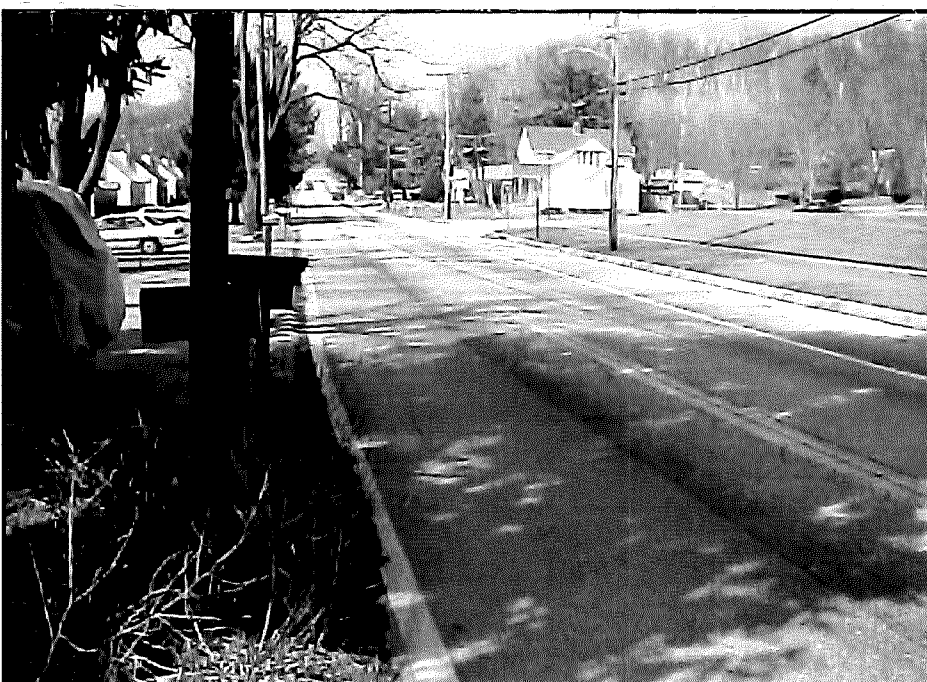
STREET SCENE OF SUBJECT PROPERTY