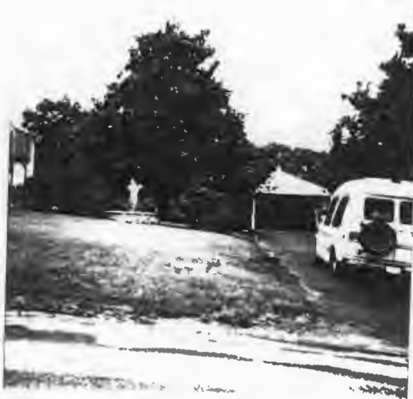
FRONT VIEW of PROPERTY