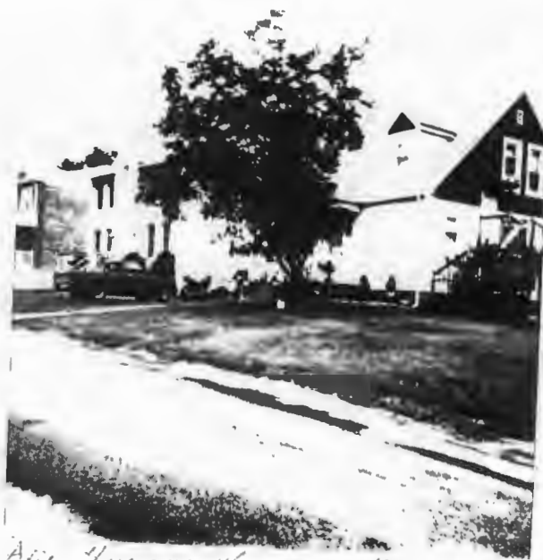
ADD HOUSE E.A. 7 of PROPERTY