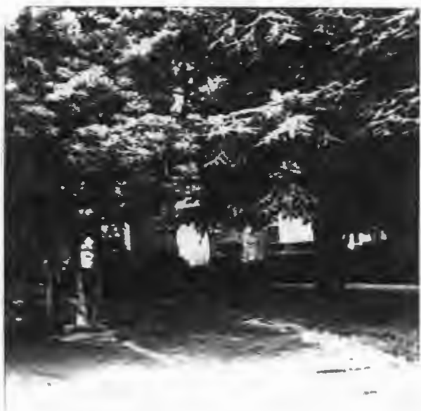
ADD HOUSE E.A. 7 of PROPERTY