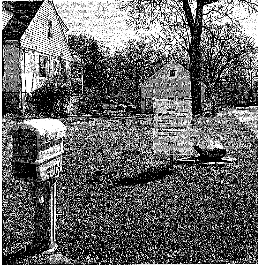
Background Photo 3213 Mayfield Avenue ~ 3/29/2021 Waiver # AA-2021-0006-FW