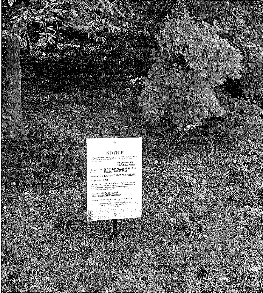
Background photo of sign @ 8315 Bellona Avenue ~ 8/14/2022 WAIVER # UA-2022-0011-FW