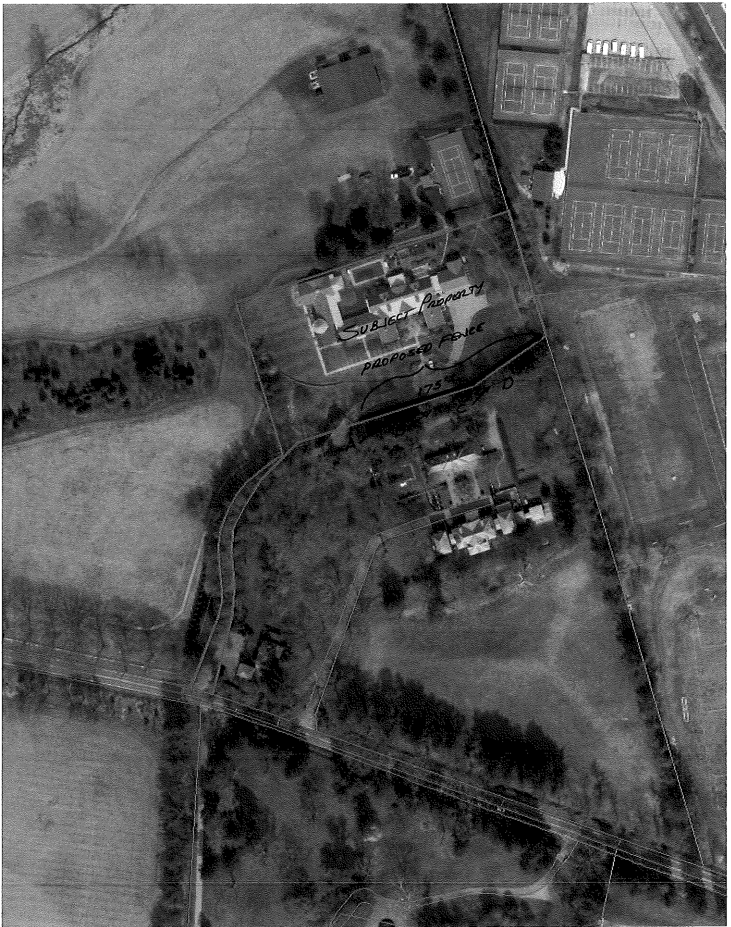
AERIAL PHOTO SHOWING FENCE LOCATION KEY SHEET FOR SITE PHOTOS