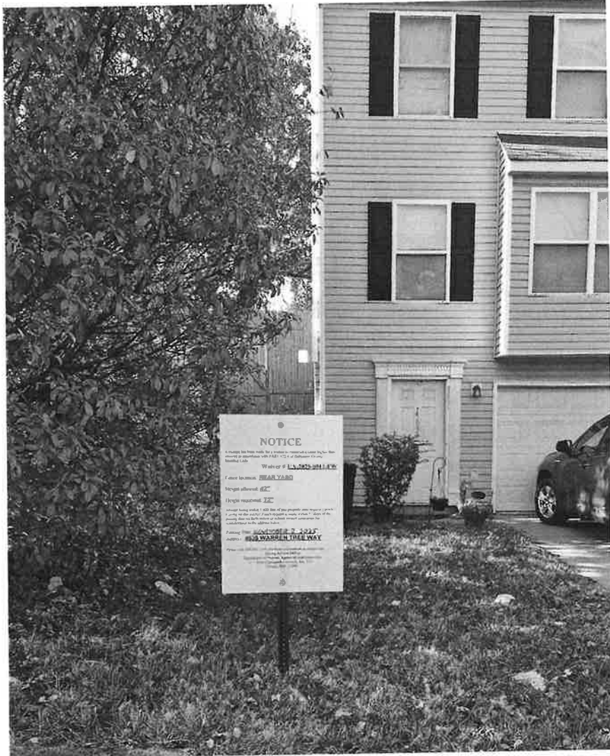
Background Photo @ 4630 Warren Tree Way ~ 11/2/2025 WAIVER # UA-2025-0011-FW